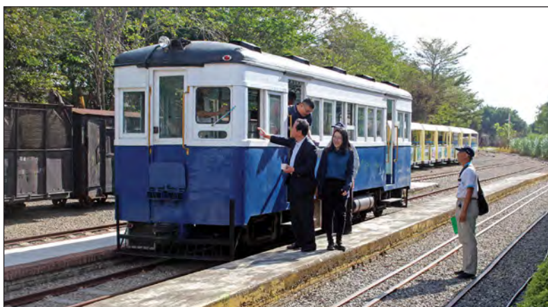
Lower right: This well restored Hitachi railcar runs at Xihu.