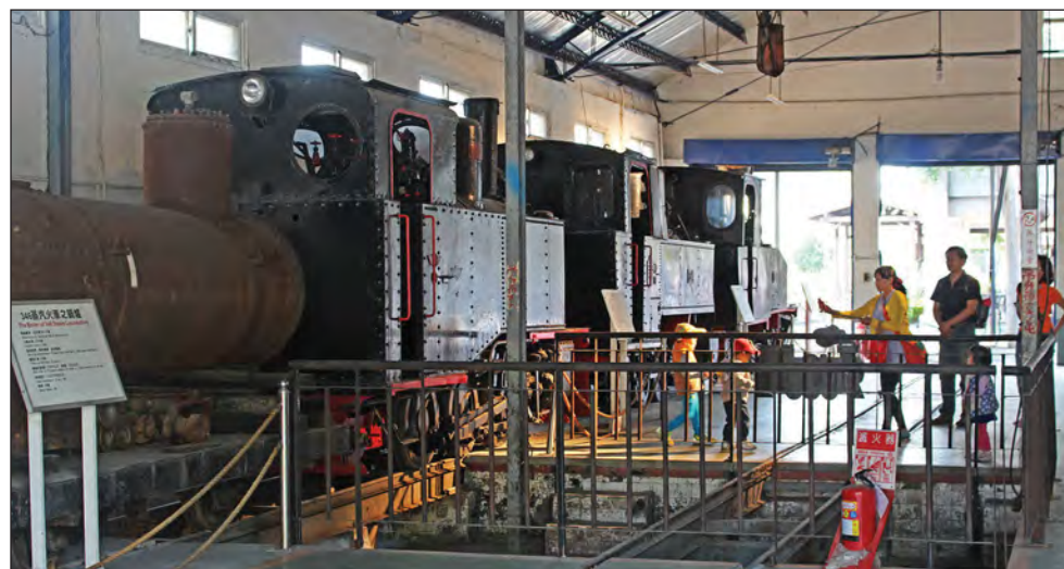
Below: On static display at Xihu are these examples of European and Japanese steam.