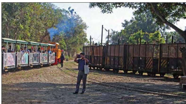
Upper right: Carriages for the heritage trains (left) have been converted from sugar cane cars at right.