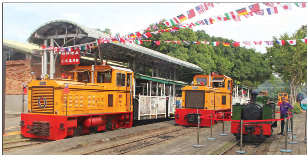
Above: Calm before the storm. Visiting W&LLR Barclay loco 'Dougal' in steam at Suantou ahead of the sugar festival, alongside two working Diema diesels.

Yet while wanting to progress its heritage, TSC faces great challenges, being very unsure about how to go about it, and a prime reason for signing the agreement with the W&LLR is to learn about the most effective way of operating heritage railways. Efforts to understand this included a full-day 'international railway forum' held the day before the festival, with presentations from three European heritage railways and two »