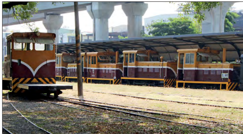
Below: Riding the train at Suantou travellers pass lines of wagons that formerly conveyed sugar cane to the mill.